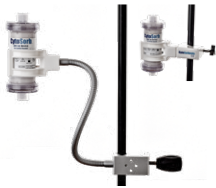
Mounting option for CytoSorb