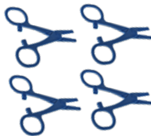
4 x plastic scissor clamps