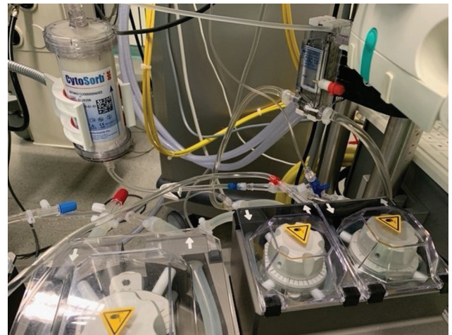
Fig. 1 The demonstration of including the CytoSorb adsorber into the CPB circuit of the HLM. The adsorber is made of biocompatible porous polymer beads able to remove substances from whole blood based on pore capture and surface adsorption by using a roller pump and optimal blood flow rate at 500 ml/min. CPB: cardiopulmonary bypass; HLM: heart–lung machine

Rethoracotomy was performed if >1.000 ml drainage volume occurred over 6 hours without a tendency for improvement and a suspicion of arterial bleeding. Furthermore, we noted days in the intensive care unit (ICU), total length of stay, and 30-day mortalities (cardiac/non-cardiac death). Ongoing resuscitation and severe sepsis were general exclusion criteria for the study. All relevant baseline clinical data are given in Table 1 .